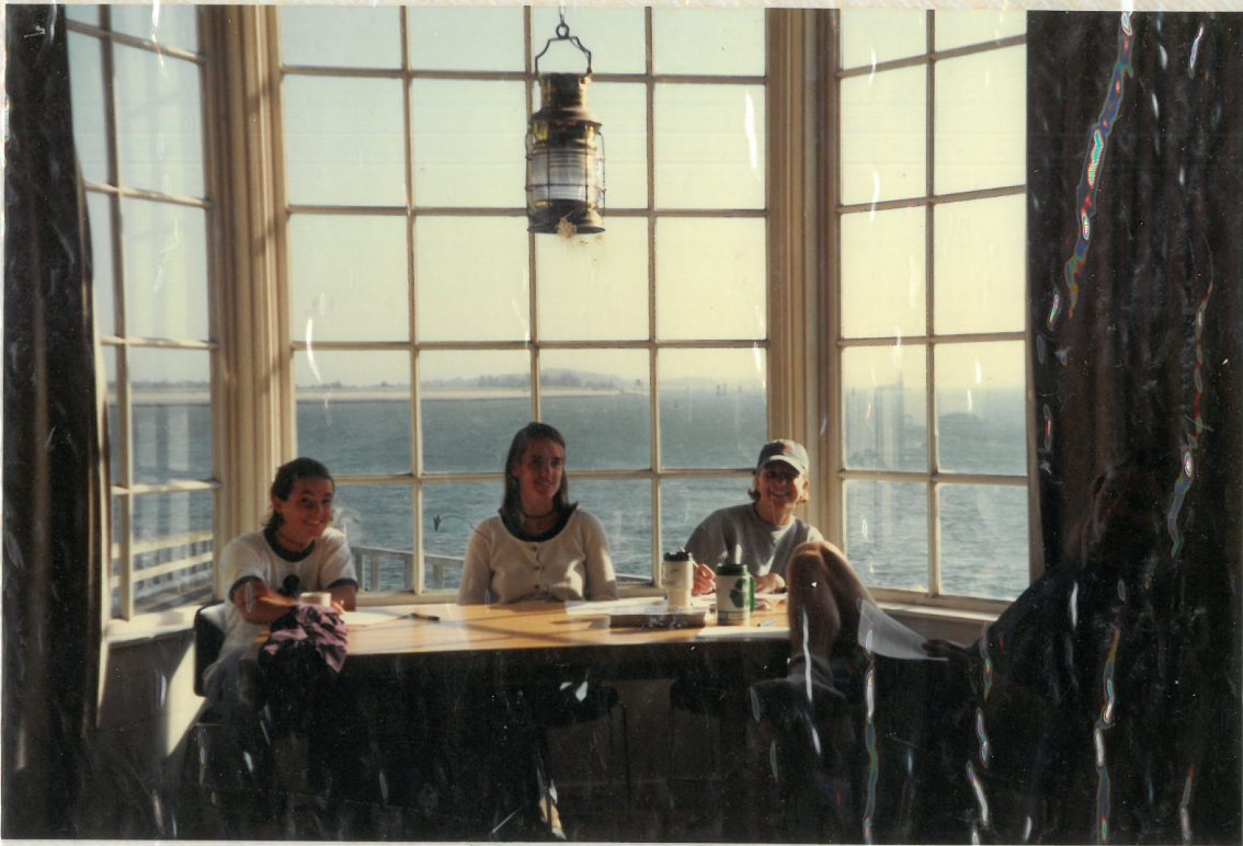
OIMB boat house