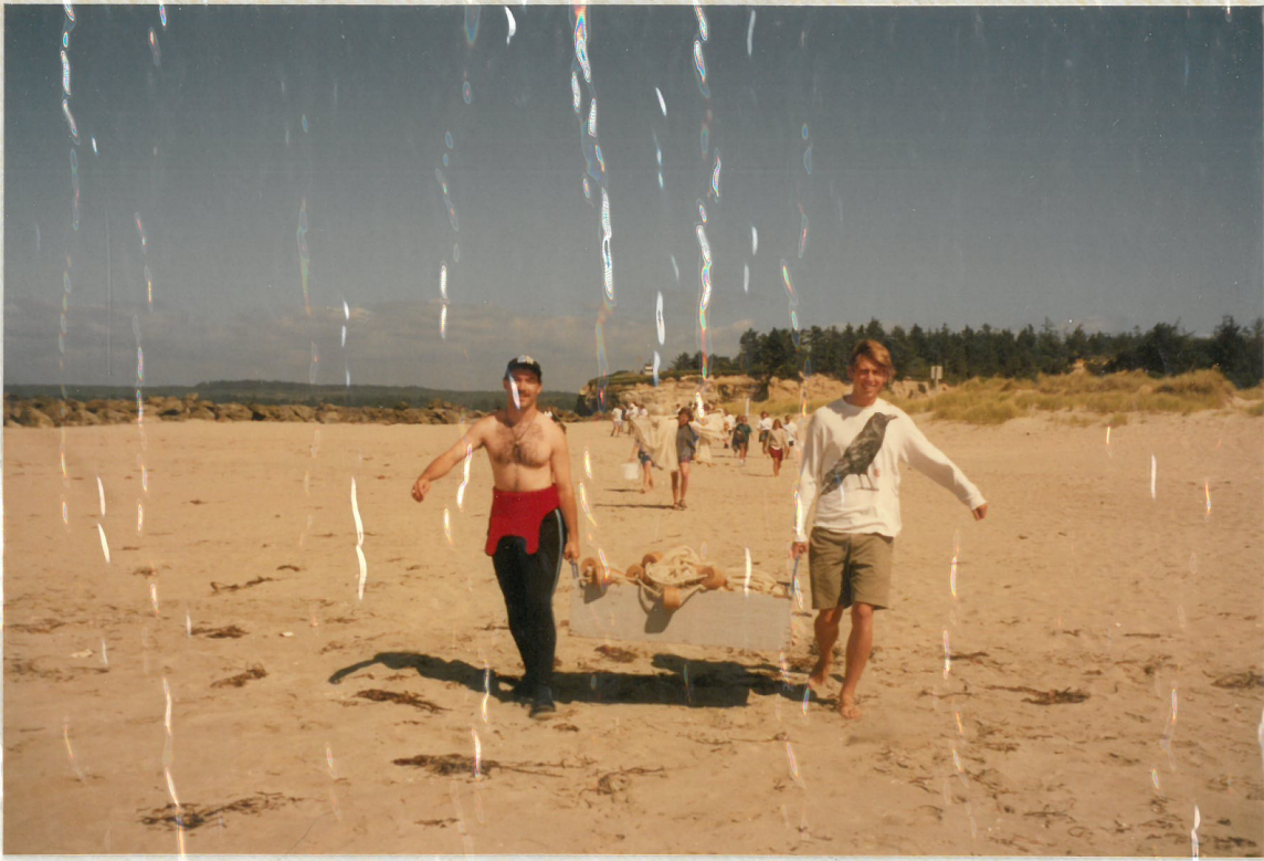
Surveying marine abundance with a seine net.