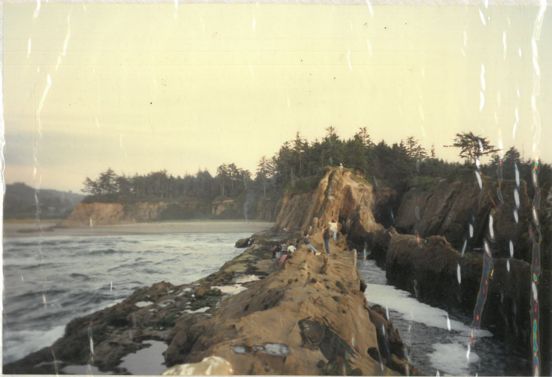
Pirate's Cove that is my Invertebrate Zoology teacher looking like a smores guardi